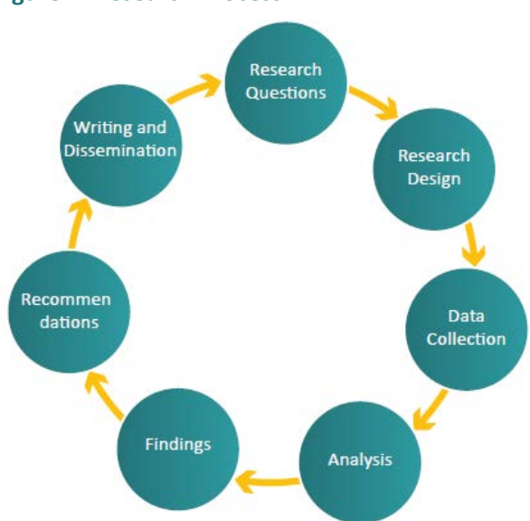
Figure 1: Research Process

Participatory research—sometimes referred to as community-based participatory research is an orientation to research that focuses on the "collaborative participation of trained researchers as well as local communities in producing knowledge directly relevant to the stakeholder community" (Pant, 2014, p. 583). Those most affected by an issue or condition that is being studied or evaluated are involved in the different stages of the research process (see Figure 1), from determining what to study and how best to study it, to collecting and analyzing data, to determining and writing up major findings and recommendations.