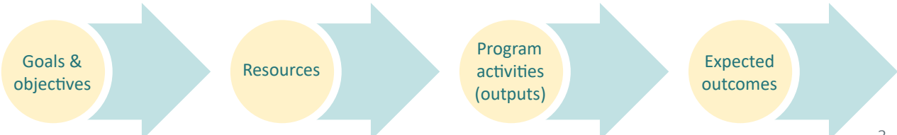
Figure 2. Main components of a logic model

A logic model is a visual representation of the framework. It shows how the respective program components—including goals and objectives, target population (including eligibility criteria and anticipated number of participants to be enrolled), resources (e.g., staff, funding), and activities (e.g., intensive case management, counseling)—are logically organized to reach desired outcomes ( Figure 2 ). Be sure that all components of the program logic model are well defined, specific, and logically ordered, with plausible connections between program activities and expected outcomes, so that your evaluation partner can